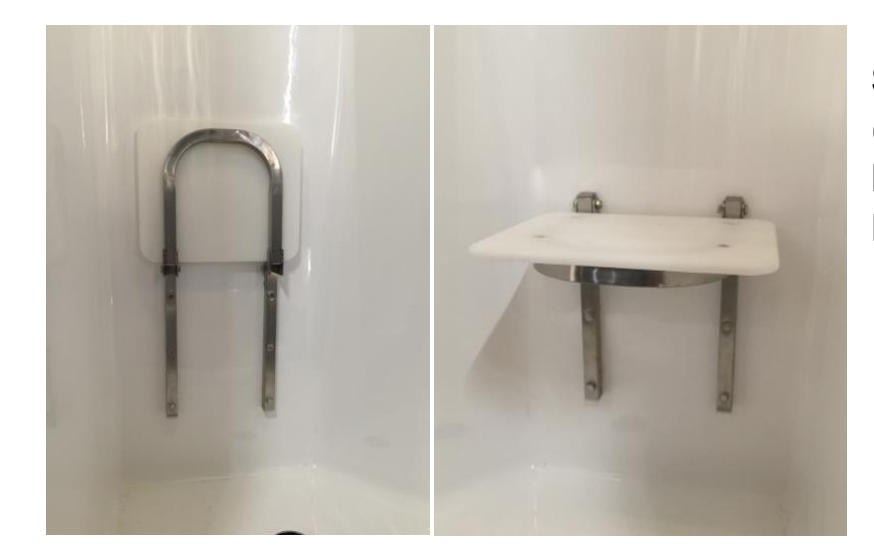
Stainless Steel Seat (Folding Up – Down Wall Mounted Shower Seat) Factory Fitted