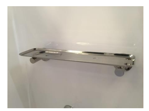
400mm Stainless Steel Shelf Factory Fitted