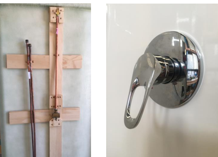
Shower Mixer with Copper Combination (1350mm Tails) Factory Fitted