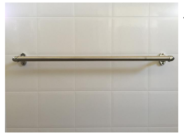
Towel Rail Fitted to Side Wall Factory Fitted