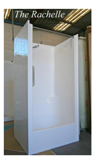
Side Wall & Side Wall over Copper Combination Factory Fitted