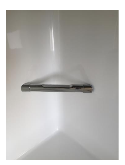
Chromed Poly Carbonate Foot Rest Factory Fitted

Stainless Steel Soap Dish Factory Fitted